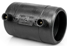
ELECTROFUSION COUPLER From 20mm to 630mm