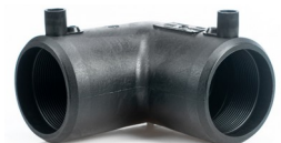
ELECTROFUSION ELBOW 90° From 25mm to 250mm