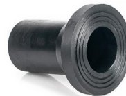
SPIGOT FLANGE ADAPTOR From 32mm to 315mm