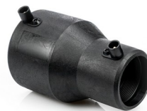
ELECTROFUSION REDUCER From 25/20mm to 225/160mm