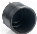
SPIGOT END CAP From 63mm to 315mm