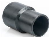
SPIGOT REDUCER From 63/32mm to 315/280mm