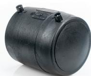
ELECTROFUSION END CAP From 20mm to 315mm