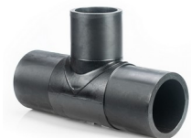
SPIGOT TEE From 90mm to 400mm